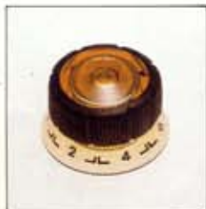
SURE GRIP II

Due to an ever increasing demand for a bass that really looks like Rock and Roll, Ibanez now offers the Destroyer Bass. Equipped with many of the same features of the Destroyer guitar, the DT600 Bass is sure to move you from side line to center spotlight as soon as you take the stage. The DT600's lightweight Birch/Basswood body is superbly balanced for extra playing comfort even after hours of intense playing. A custom designed 32" scale neck, Super P4 pickups, Hercules B machine heads, plus Sure Grip II control knobs make the DT600 an absolute must for today's discern rocker.